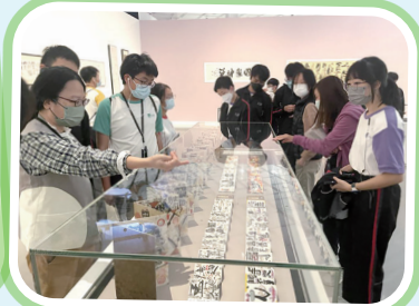
S.4 Chinese Creative Journey