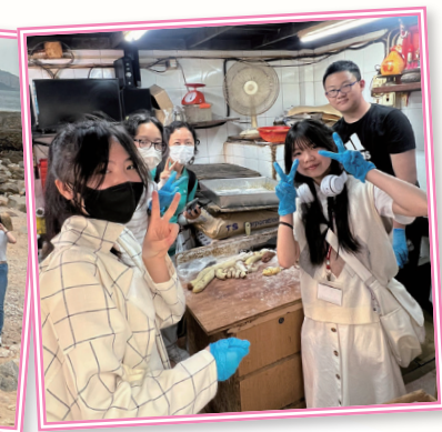
S.4 A Study of the Historic Preservation in Tung Ping Chau and Wong Tei Tung